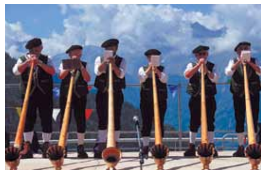
'Cor des alpes' at the Vaujany summer fête