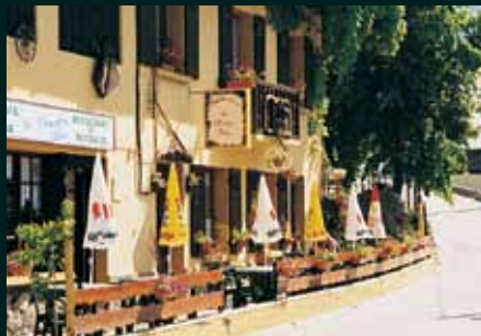
The Chardon Bleu

A little train trundles around the village allowing you to leave your car behind if you want to visit the shops in Vaujany – a small supermarket, newsagent, bakery and three sports shops.